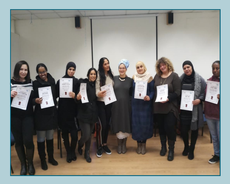
Despite Israel's record high unemployment due to COVID-19, 85% of 2020 program graduates have successfully found and maintained employment.